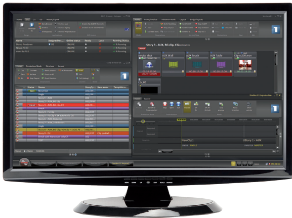
Rundown, shots and timeline