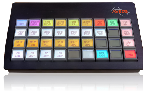
ASTRA Programmable Shotbox Control Panel